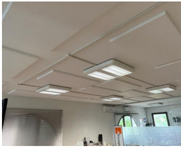
Ceiling spaced panels.