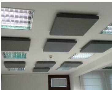
DOT ceiling mounted.