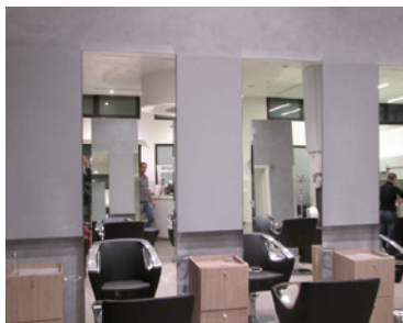
DOT wall mounted.